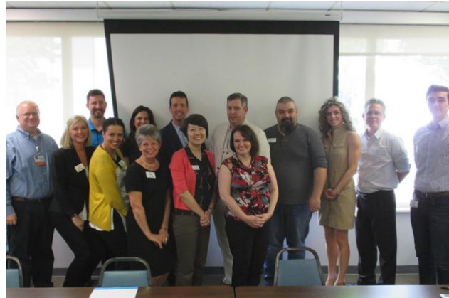
See You in the Cloud!