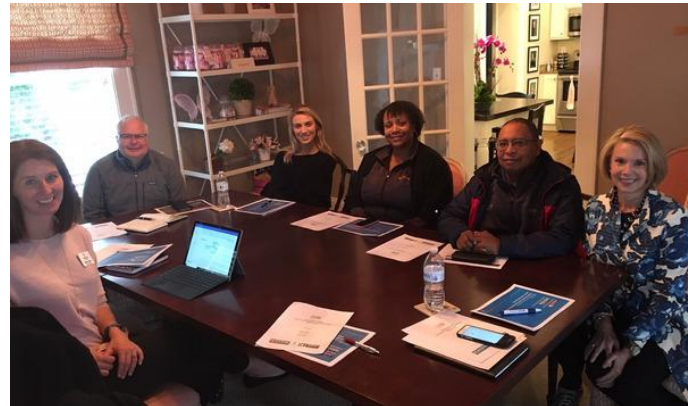
Carolina Breast Friends + Rodgers Builders Kick-Off