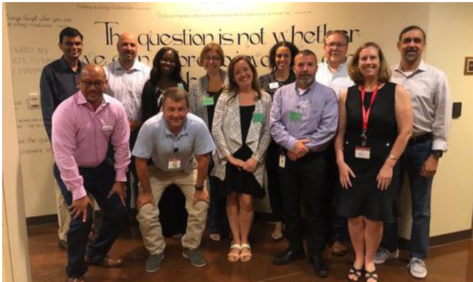
Ronald McDonald House of Charlotte + AAA Carolinas Kick-Off