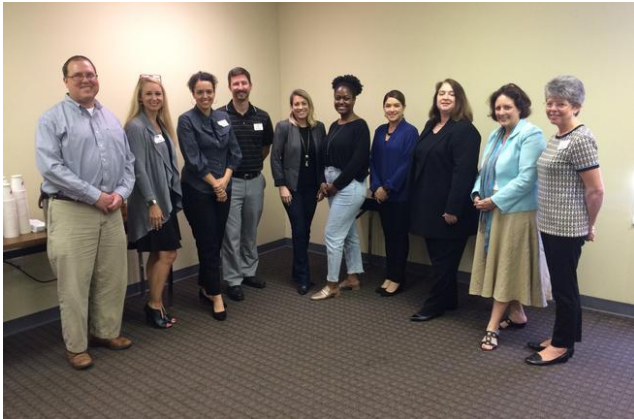
Boost Efficiency to Boost Impact

Here is a group shot from two of our most recent forums!