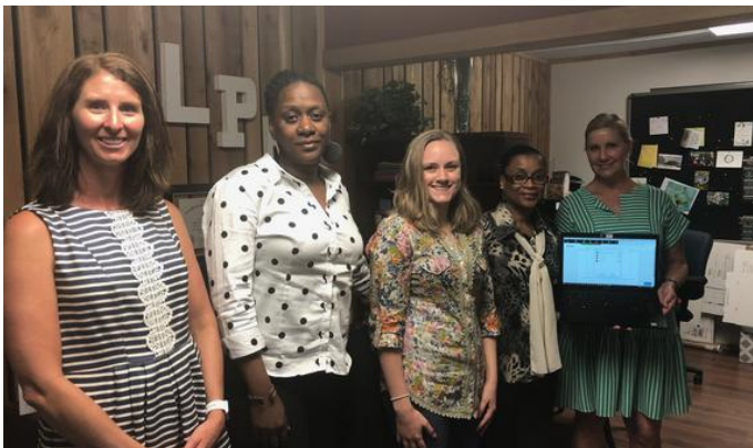
Lily Pad Haven + M&S Consulting Kick-Off

Apparo's Community Impact Projects (CIP) partner a nonprofit in need of a technology solution with a corporate volunteer to address that need. Through a series of meetings facilitated by an Apparo partner, nonprofits receive an assessment of needs and implementation of a sustainable solution to increase volunteers, donors and impact.