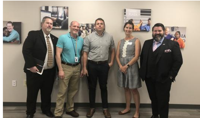
Men's Shelter of Charlotte + Bank of America Kick-Off